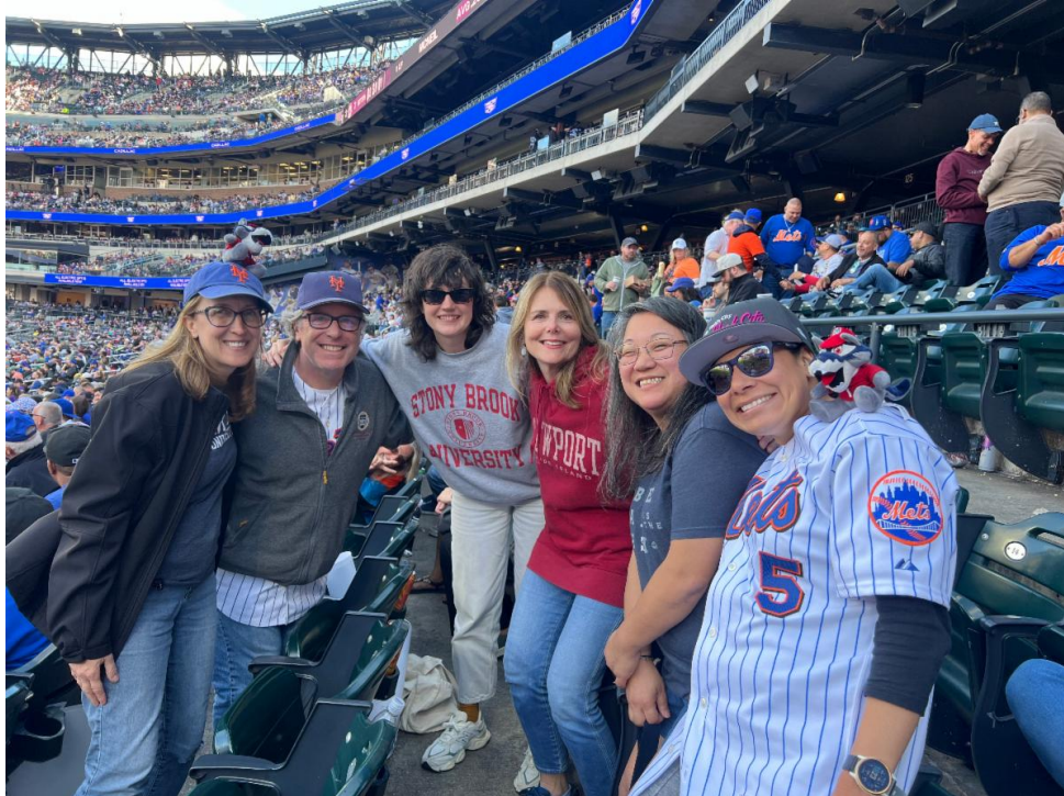
The Office of Research and Innovation at Citi Field – May 31st, 2025